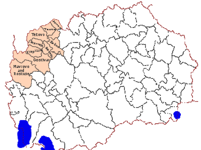
Picture 2. Polog planning region with its eleven constituent municipalities

*Note: 1. Mavrovo - Rostushe, 2. Gostivar, 3.Tetovo, 4.Tearce, 5.Bogovinje, 6.Brvenica, 7.Vrapciste, 8.Zelino and 9.Jegunovce.