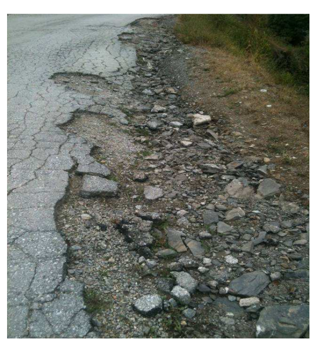
e. The local road that connects the local communities of Rostushe and Velebrdo